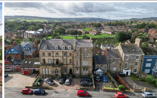
FLAT 7, 3 UPGANG LANE, WHITBY- 3 bed Apartment -£180,000