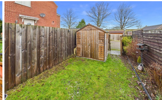
49 QUEENS DRIVE, WHITBY- 2 bed Terraced House -£185,000