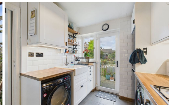
2 HALL PASTURES, SLEIGHTS- 2 bed Semi-Detached Bungalow -£175,000