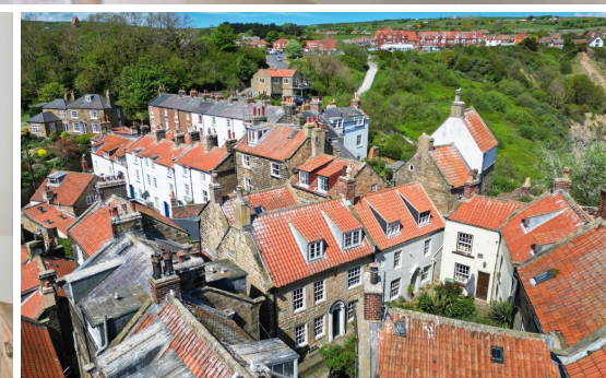
SHERWOOD HOUSE, ROBIN HOODS BAY- 3 bed Character Property -£425,000