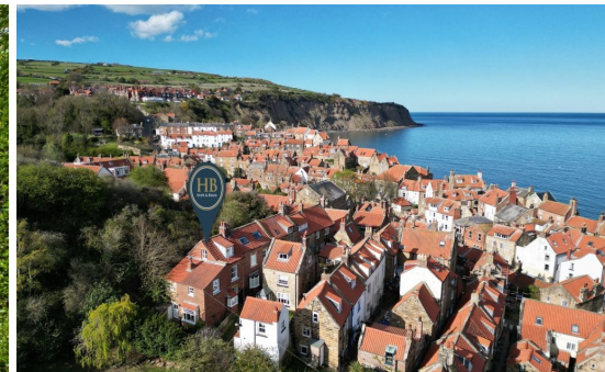
GREENFIELD HOUSE, ROBIN HOODS BAY- 3 bed Cottage -£400,000