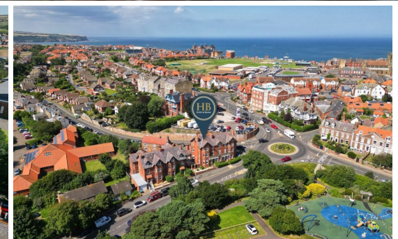
FAUNA APARTMENT, 2 CHUBB HILL, WHITBY- 2 bed Apartment -£265,000