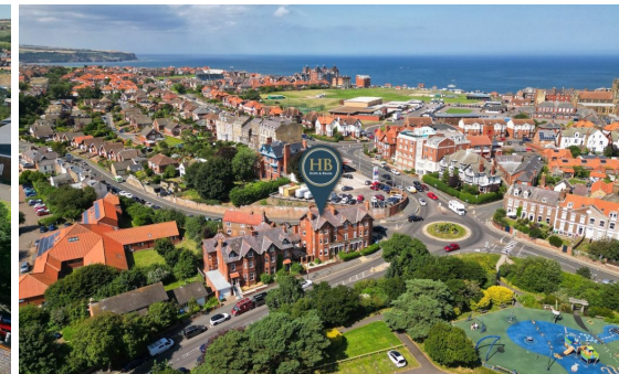
FABLE APARTMENT, 2 CHUBB HILL, WHITBY- 1 bed Apartment -£225,000