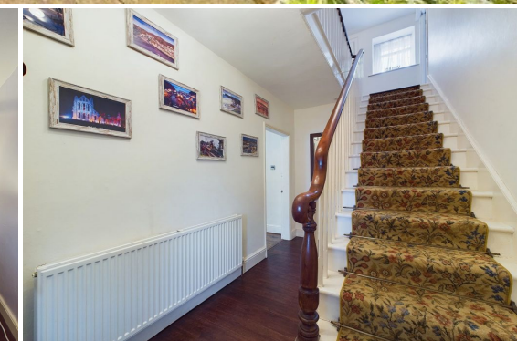
3 MOREHEAD TERRACE, EASINGTON - 3 bed Terraced House - £199,950