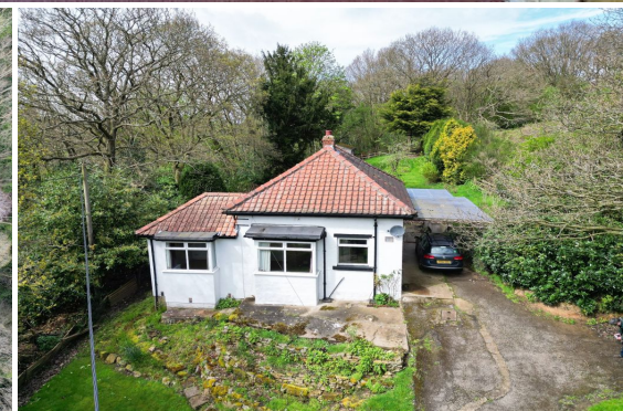
TREE TOPS, GOLDEN GROVE - 2 bed Detached Bungalow - £350,000