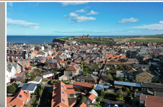
APARTMENT 13 UNION MILL, WHITBY - 1 bed Apartment - £209,950