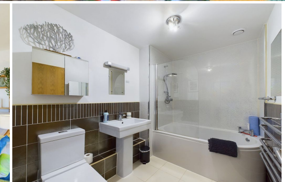
APARTMENT 13 UNION MILL, WHITBY - 1 bed Apartment - £209,950