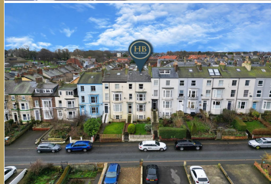
FLAT B, 12 PARK TERRACE - 1 bed Flat - £89,950