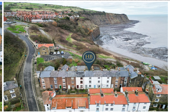
THE SMUGGLERS, ROBIN HOODS BAY - 3 bed Cottage - £400,000