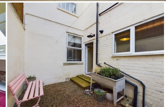
16 GROVE STREET, WHITBY - 4 bed Terraced House - £235,000