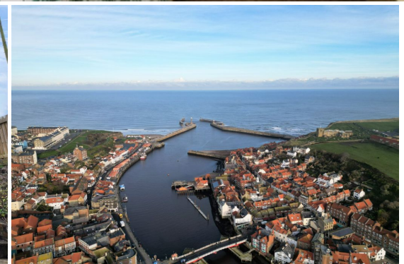
3 SALT PAN WELL STEPS, WHITBY - 1 bed Cottage - £99,950