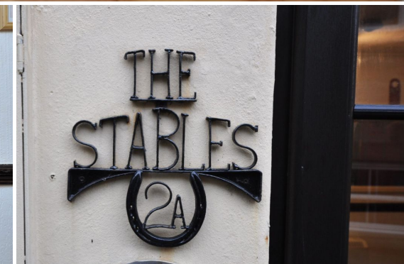
2A HORSE ROAD, WHITBY - 1 bed Cottage - £99,950