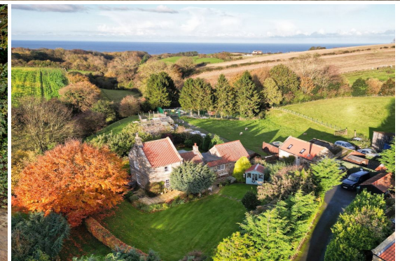
THE RETREAT, NEWHOLM - 3 bed Cottage - £795,000