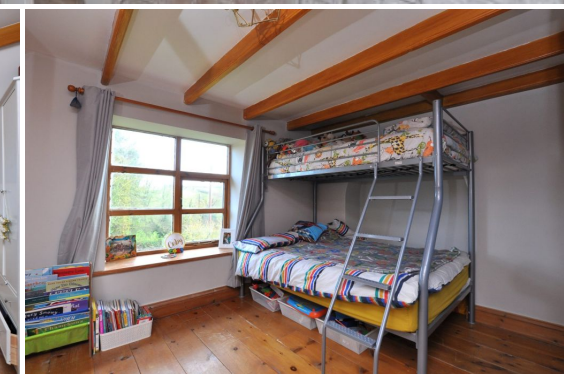
RUSSELL HALL FARMHOUSE, SNEATONTHORPE - 4 bed Detached House - £565,000