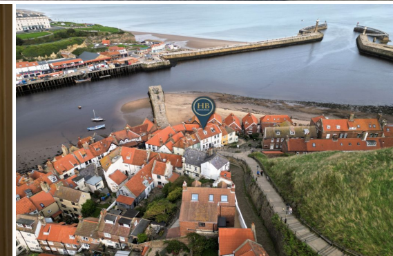
GREENFINGERS COTTAGE, 120 CHURCH STREET - 3 bed Cottage - £550,000