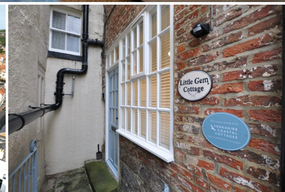
LITTLE GEM COTTAGE, 1A STAFFORDSHIRE PLACE - 1 bed Cottage - £190,000