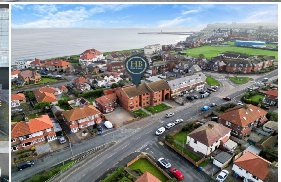
6 HOWARDS COURT, WHITBY - 2 bed Flat - £175,000