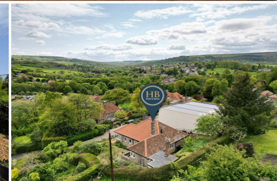
16 BROOK PARK, BRIGGSWATH - 2 bed Detached Bungalow - £360,000