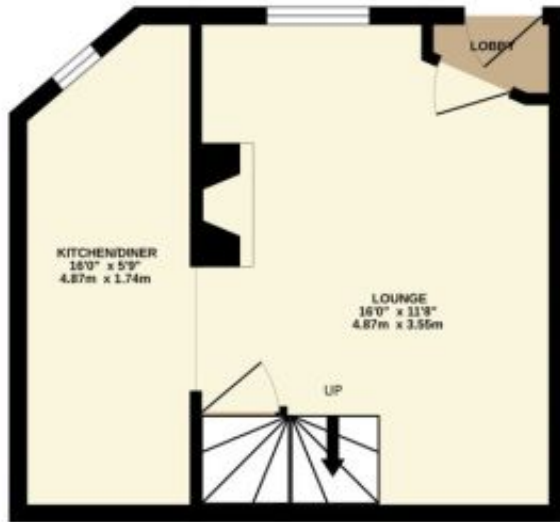
GROUND FLOOR 265 sq.ft. (24.6 sq.m.) approx.