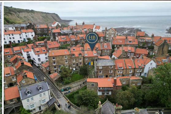
5 SUNNY PLACE, ROBIN HOODS BAY - 2 bed Cottage - £350,000