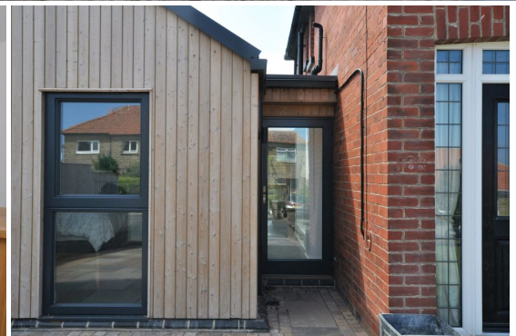
129 UPGANG LANE, WHITBY - 4 bed Semi-Detached House - £495,000