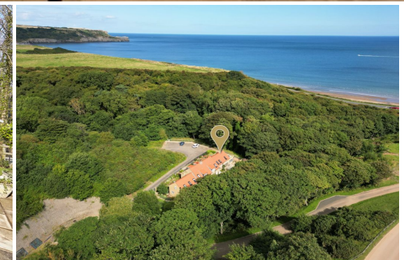
LITTLEBECK COTTAGE, RAIHWAITHE ESTATE - 3 bed Cottage - £800,000