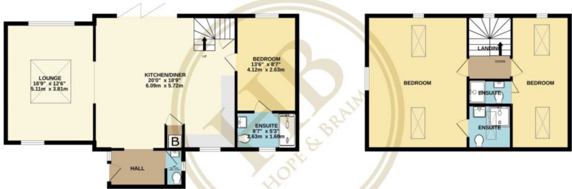
1ST FLOOR 537 sq.ft. (49.9 sq.m.) approx.

TOTAL FLOOR AREA : 1338 sq.ft. (124.3 sq.m.) approx.