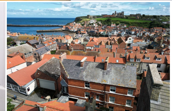
29B, SILVER STREET - 1 bed Flat - £125,000