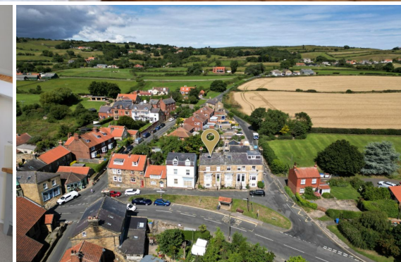
3 NORTH TERRACE, FYLINGTHORPE - 4 bed End of Terrace House - £325,000