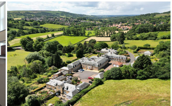
8 THE WILLOWS, CARR HALL GARDENS - 2 bed Apartment - £340,000