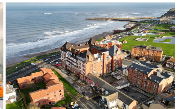
47 METROPOLE TOWERS - 2 bed Apartment - £250,000