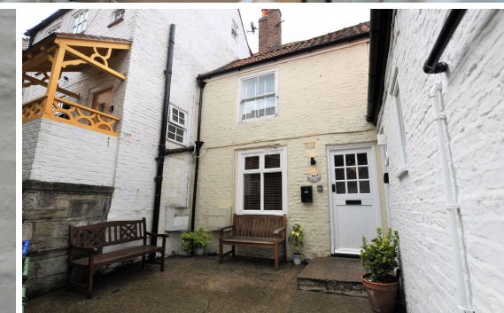
THE ROCKPOOL, CARRS YARD - 1 bed Cottage - £199,950