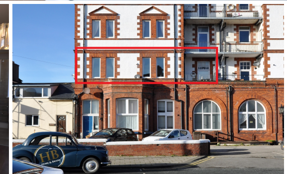
1 METROPOLE TOWERS, WHITBY - 1 bed Apartment - £185,000