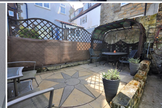
THORNABY COTTAGE, MCLACKLINS YARD - 2 bed Cottage - £225,000